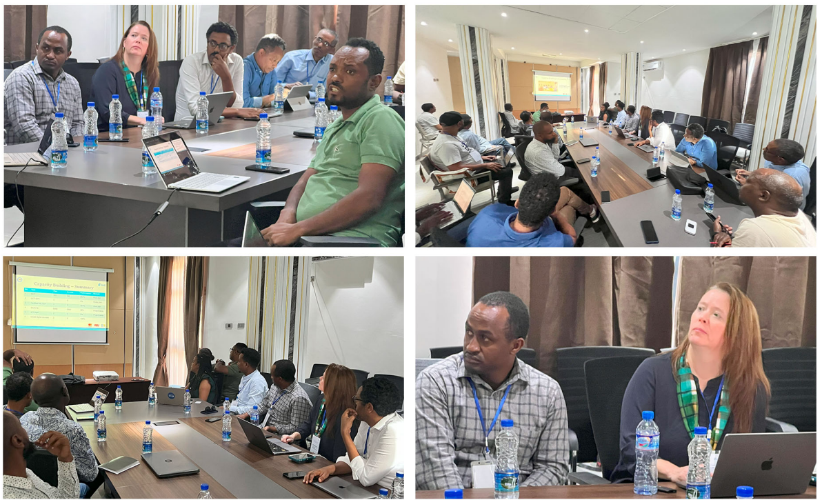
Discussion with e-Learning Coordinators and ICT Directors

The e-SHE team also appreciated the progress they made after their previous quarterly reports and pledged to address their concerns with concerned stakeholders.