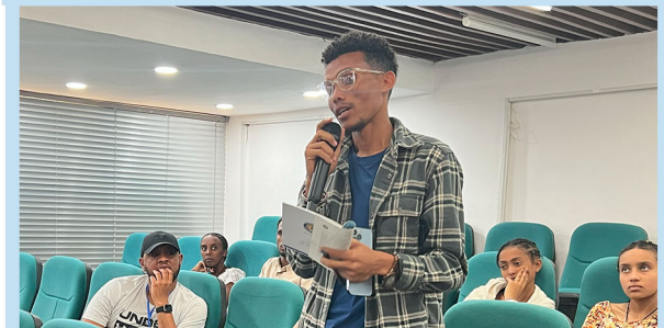
Discussion on the 2024 Plan